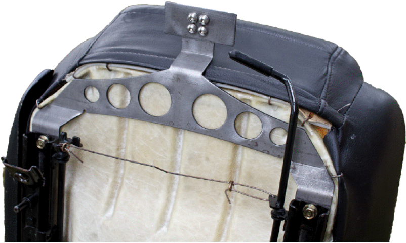
Bracket installed – seat bottom view

Once removed from the vehicle, place the seat upside down on a clean towel or something soft that will not damage the seat's material.